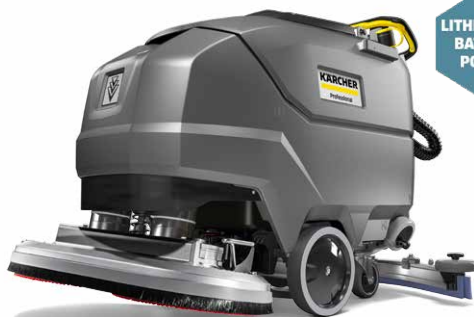
BD 70/75 W BP CLASSIC