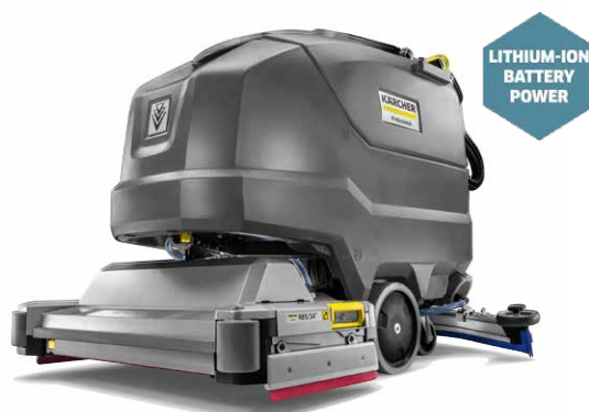
BR 85/100 W BP CLASSIC