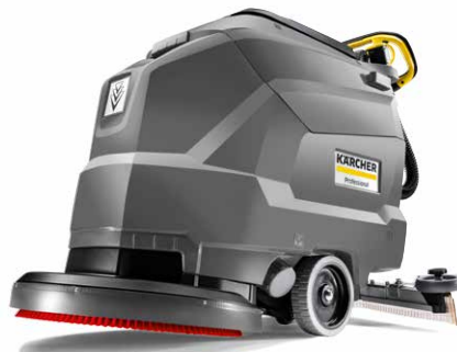
BD 50/50 C BP CLASSIC