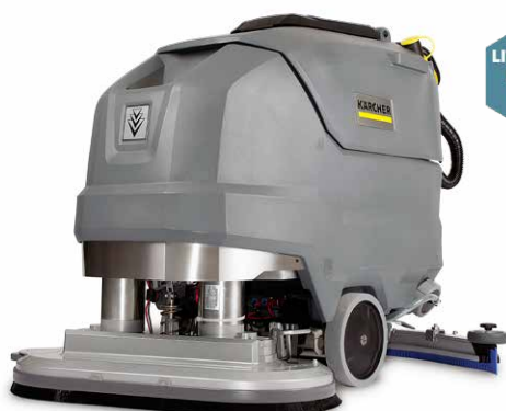
BD 80/100 W BP CLASSIC