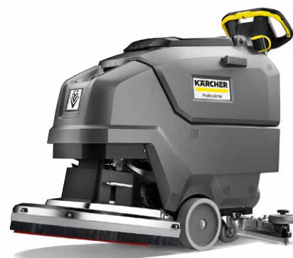
BD 50/55 W BP CLASSIC