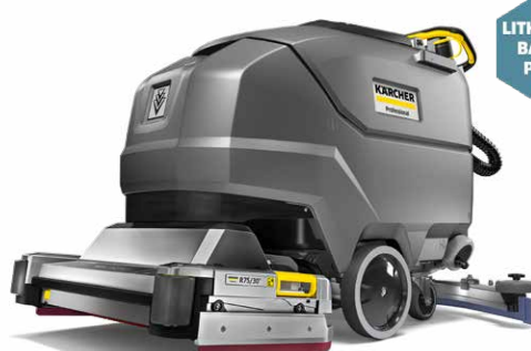
BR 75/75 W BP CLASSIC