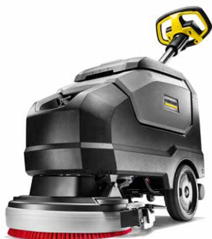
BD 35/15 C BP CLASSIC

Designed to meet all of your scrubbing needs without breaking the bank. With the BD 70/75 W Bp Classic, BD 75/75 W Bp Classic, BD 80/100 W Bp Classic, BD 50/55 W Bp Classic and BD 50/50 C Bp Classic scrubbers, Kärcher presents its Classic Scrubber line. These machines are battery-operated, have a very solid construction, and are characterized by their simple operations.